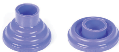
Depress dust cover