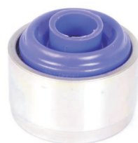
Fit onto bush